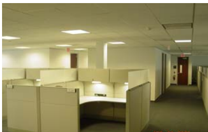
SCI Building Retrofit

Owner: HISD – Gilbane Architect: Kirksey Contract: CSP – New Construction - $4,399,460 Completion: June 2005