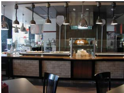
UH Moody Dining Hall