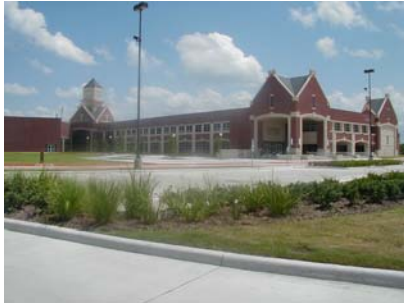
Manvel High School