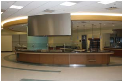
MD Anderson PT & FC TBO