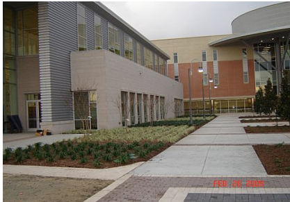
Houston Community College Stafford Learning Hub