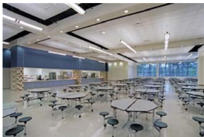
Pershing Middle School