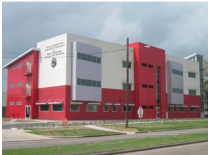
Tejano Center for Community Concerns