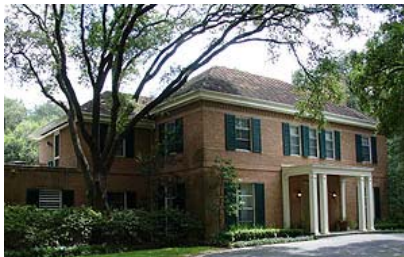
Rice University O'Connor House