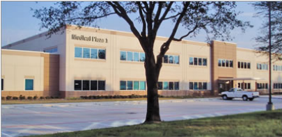
Memorial Hermann Cypress POB

Pearland, Texas Owner: DASCO Architect: Morris Architects Contract: Hard Bid – New Construction - $4,726,000 Completion: December 2006