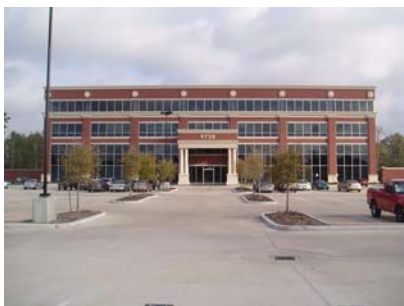
Raveneaux Office Park