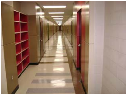
PAISD Memorial 9 th Grade Conversion to WTTS