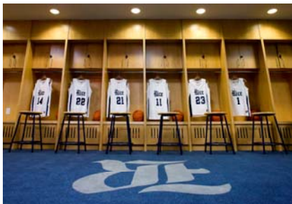
Rice University Autry Court Renovations