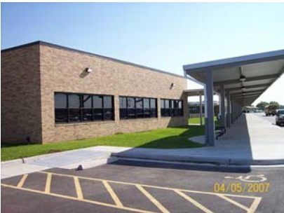
Lamar Consolidated Junior High School