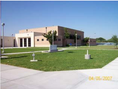
Lamar Consolidated High School