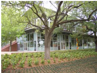
Houston Downtown Park & Garage (Discovery Green)