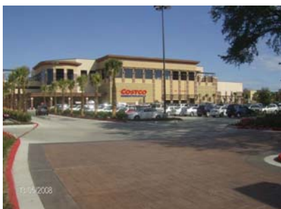
Greenway Commons / Costco