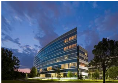
Four Chasewood Office Building