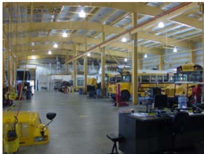
HISD Northwest Bus Maintenance Facility