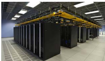
Rice Data Center