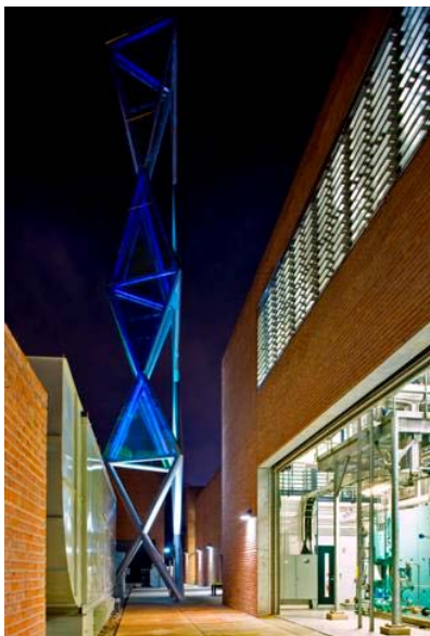
Rice University South Utility Plant