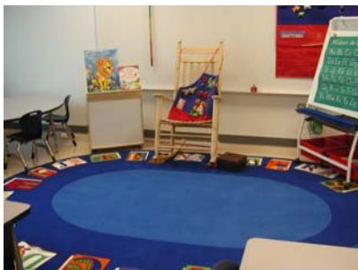
West Central Pre-Kindergarten Center