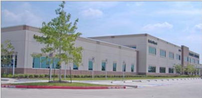
Memorial Hermann Pearland POB

Rosenberg, Texas Owner: LCISD Architect: Ambrose, McEnany & House Type: CSP - Renovation & New Construction - $14,578,000 Completion: May 2007