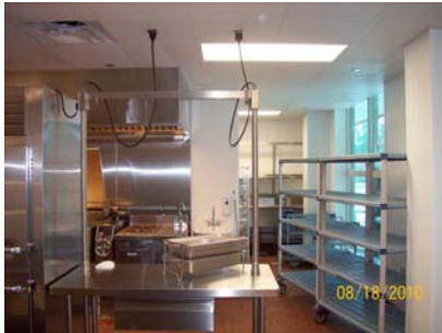
PAISD Sam Houston Elementary School