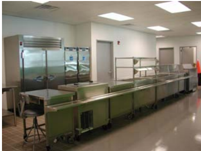
North District Pre-Kindergarten Center