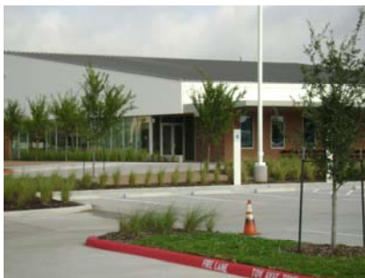
St. Cuthbert Episcopal Church