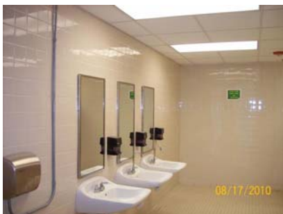
PAISD Stephen F. Austin Middle School