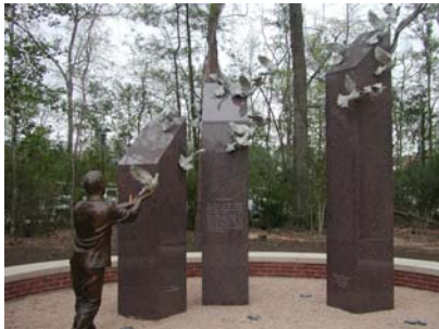
Woodlands Town Green Park