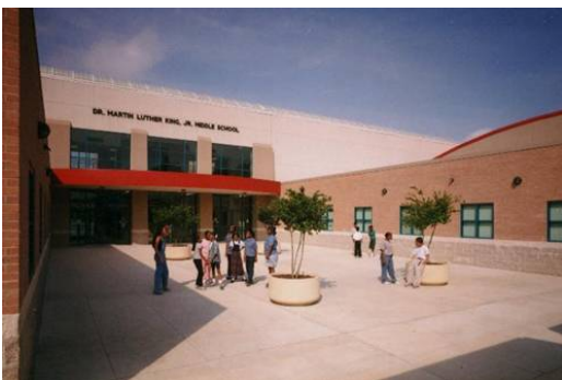
MLK Middle School