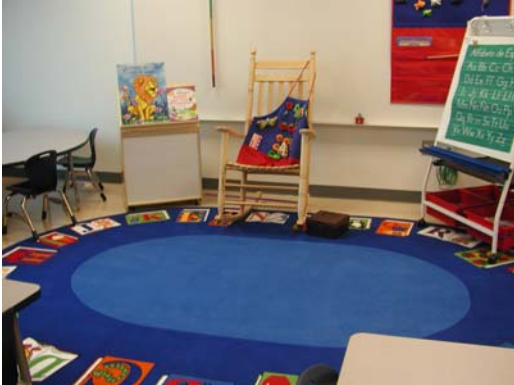
West Central Pre-Kindergarten Center