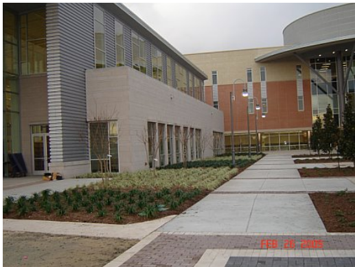
HCC Stafford Learning Hub