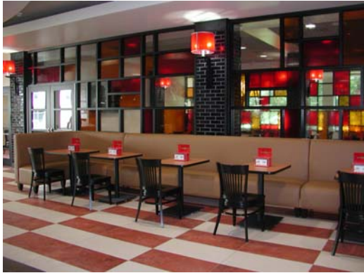
U of H Moody Dining Hall Renovations