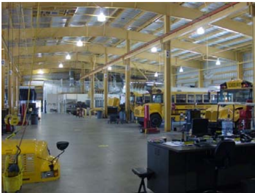
North West Bus Maintenance Facility