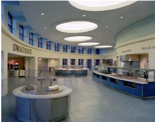
Jones Kitchen Servery