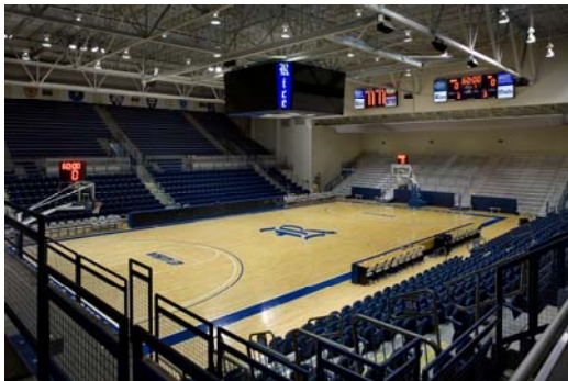
Autry Court Additions & Renovations