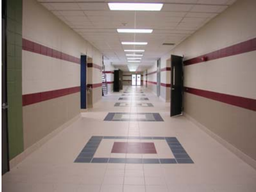
Roberson Middle School