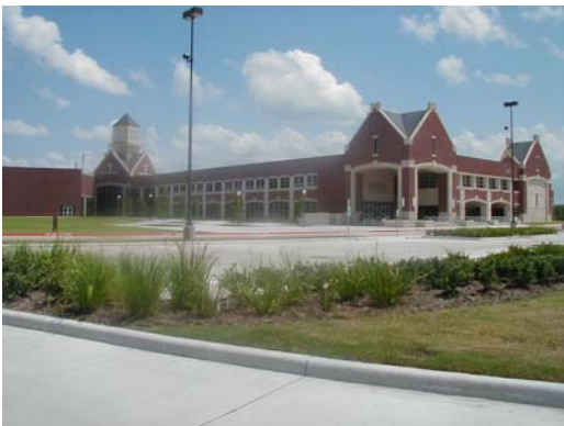
Manvel High School